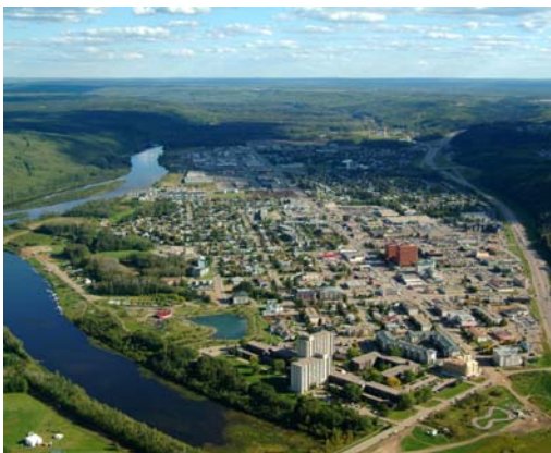
Downtown Fort McMurray